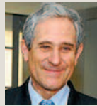
François Rivasseau European Special Envoy for Space, European External Action Service (EEAS)