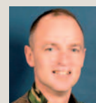
Lieutenant General Michiel van der Laan Commander 1 (German/Netherlands) Corps