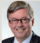
Dr Hans-Peter Bartels Parliamentary Commissioner for the Armed Forces, Federal Republic of Germany