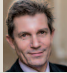
Louis Gautier Secretary General for Defence and National Security (SGDSN), French Republic