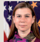
Elissa Slotkin Acting Assistant Secretary of Defense for International Security Affairs, U.S. Department of Defense