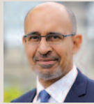
Harlem Désir Secretary of State of European Affairs, Ministry of Foreign Affairs, French Republic