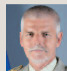
General Petr Pavel Chairman NATO Military Committee