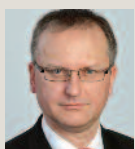
Daniel Košťoval Deputy Minister for Armaments and Acquisition, Ministry of Defence, Czech Republic